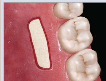
After HemCon Dental Dressing