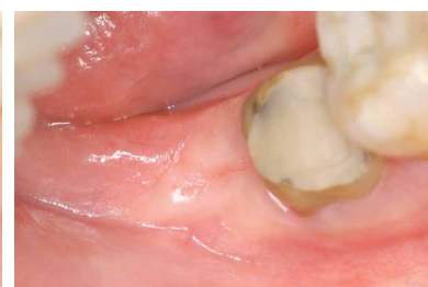
Wound site after three weeks.