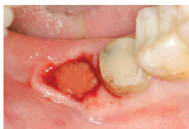
Extraction site on alveolar ridge.