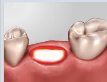
After HemCon Dental Dressing